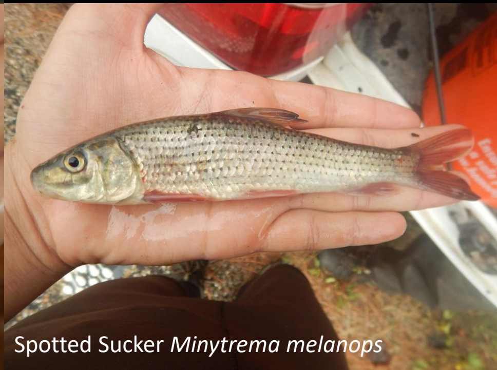
Spotted Sucker Minytrema melanops