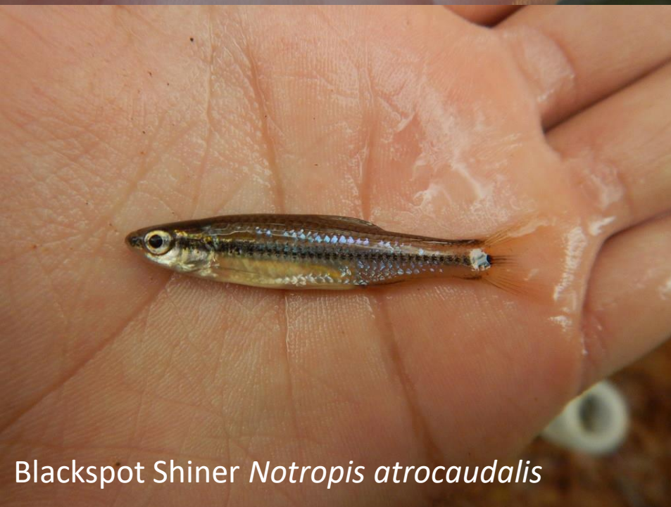
Blackspot Shiner Notropis atrocaudalis