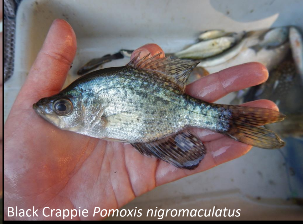
Black Crappie Pomoxis nigromaculatus