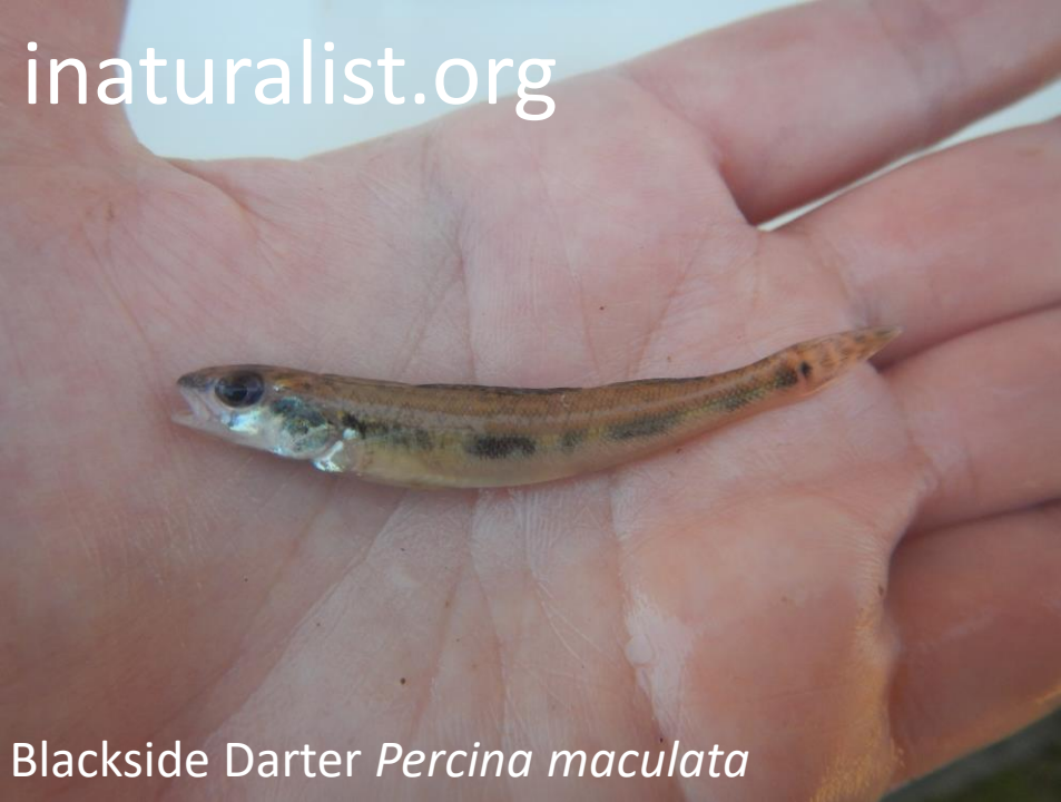
Blackside Darter Percina maculata